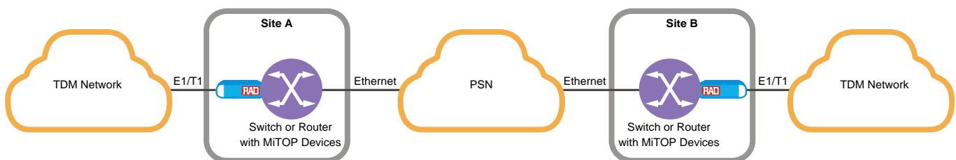
Figure 3. Delivering E1/T1 Services over PSN